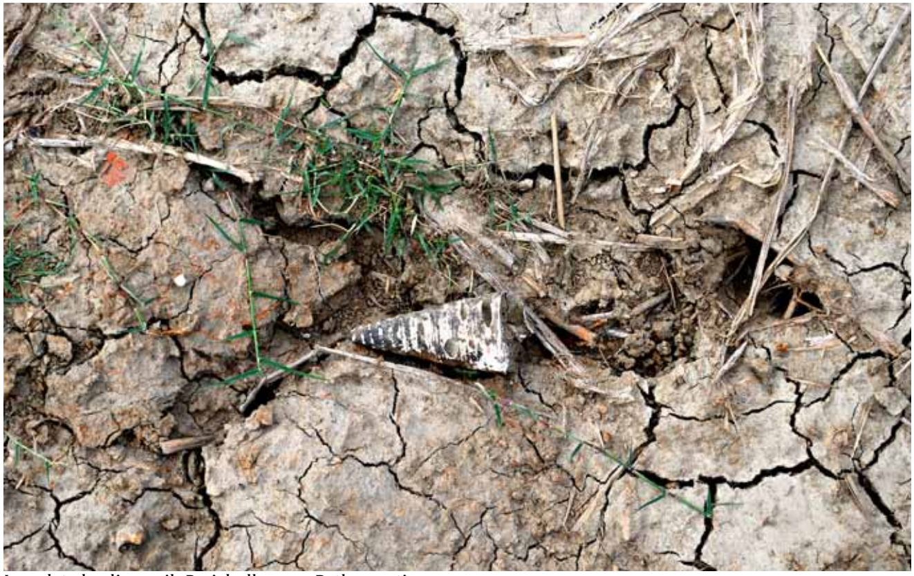
Inundated saline soil, Brajaballavpur, Patharpratima

Frequent floods and cyclonic storms cause inundation and consequently salinity in the soil. Saline soil is unfit for cultivation for a minimum of 3 to 4 years. Increase in salinity affects the biotic composition of the region. Increase in temperature and variability in rainfall decreases the inflow of freshwater. Frequently occurring drought forces farmers to turn helplessly towards moneylenders to support their farming and sustenance expenditure. Difficulties in farming forces farmers to take up activities that put pressure on forest land – sale of firewood collected from the forest, sale of forest honey, and cutting down of trees to make furniture. Indiscriminate destruction of mangroves for firewood and other needs is destroying the mud dykes that protect the Sundarbans from the raging sea and thus threatens human settlements during high tides.