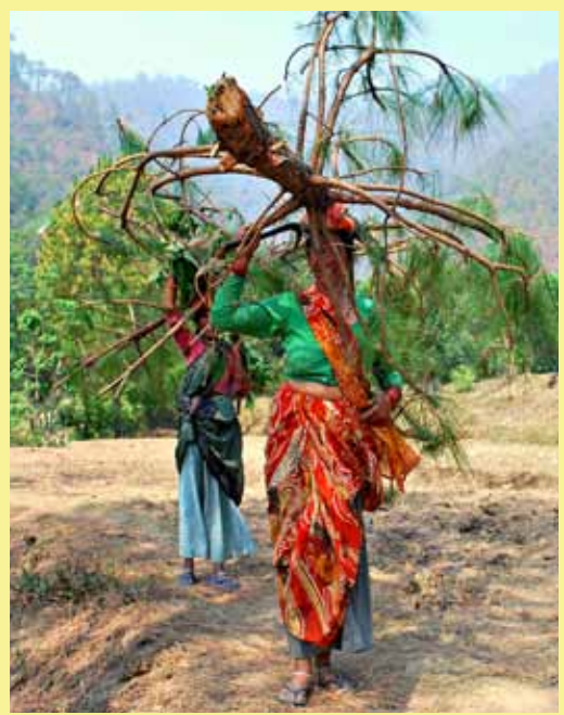
Collecting firewood, Basbeda, Chaukutia, Almora District

The Himalayan ecosystem is mainly threatened by global climate changes like erratic rainfall, and rising temperatures.