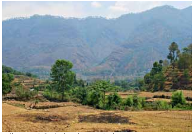
Fallow Land, Basbeda, Almora District

Migration for better livelihood prospects has always been ailing this hill state but large scale migration as a response to climate change induced conditions like scarcity of water resources and increase in temperature and its effects on crops is the latest setback in the region's local development. Families either migrate all together or some members shift to nearby towns to supplement family income.