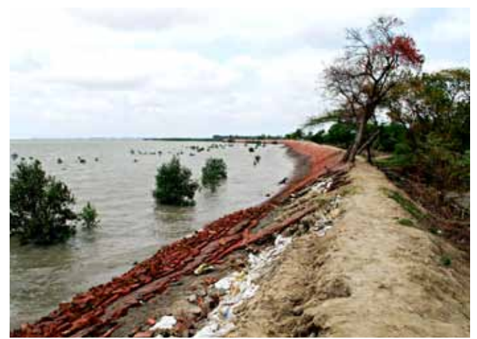
Broken river bund, Brajaballavpur, Patharpratima