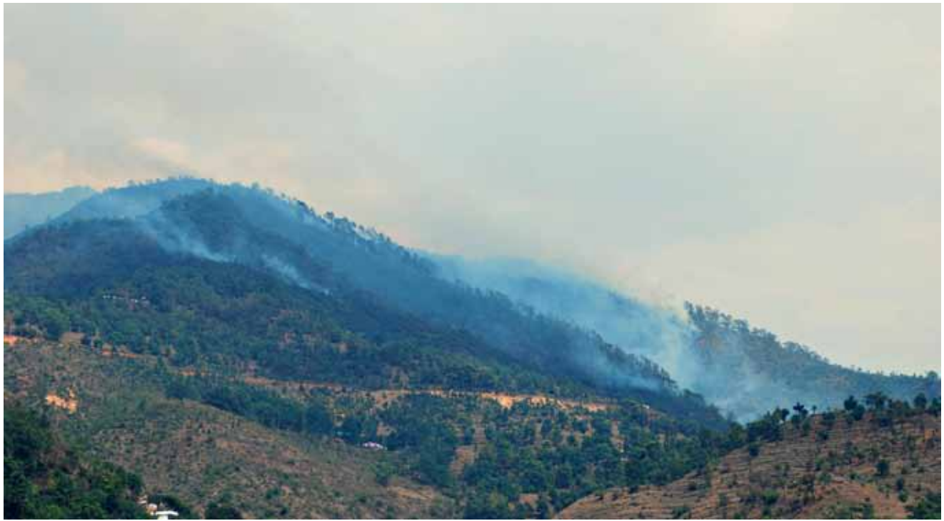
Forest Fire, Chaukutia, Almora District