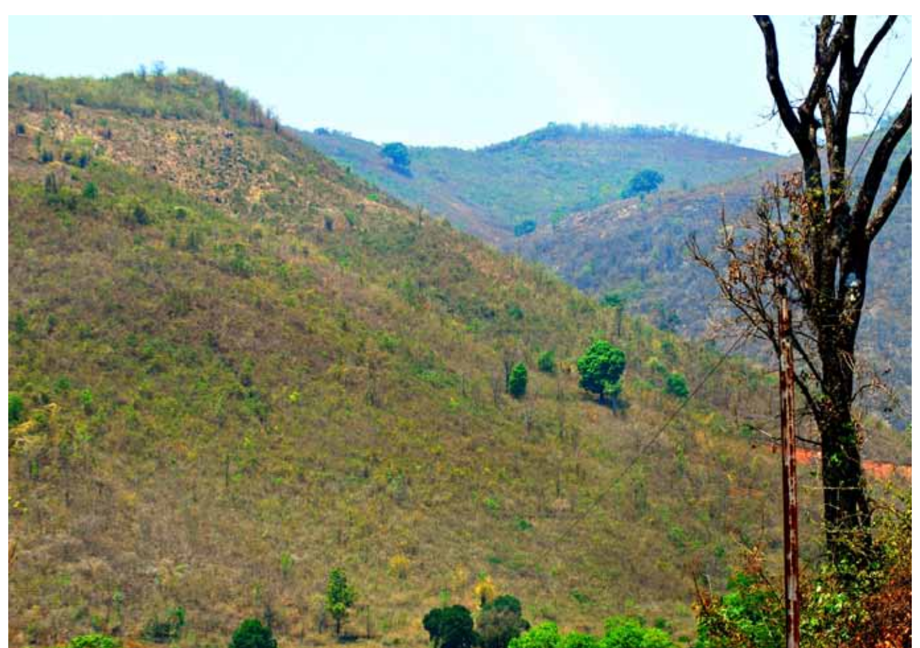
Deforested hills of Pathakota

With perennial streams, which are sources of drinking water and alternate sources of irrigation, turning seasonal and the decreasing levels of ground water, farmers are forced to give up the cultivation of food crops like millets and pulses and switch to cash crops that require less water. This will affect food security in the long run and increase the cost of living. Need for fertile and cultivable land increases pressure on forest land and eventually leads to deforestation that triggers a change in rainfall pattern. With a decrease in yield, farmers turn helplessly towards moneylenders to rescue them out of dire straits. This only gives rise to newer problems – debt with no guarantee of repayment.