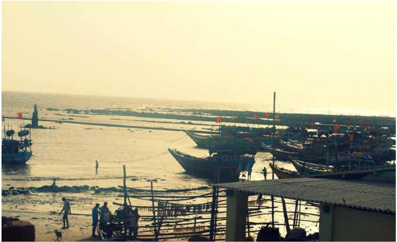
Manori, Dharavi Bet