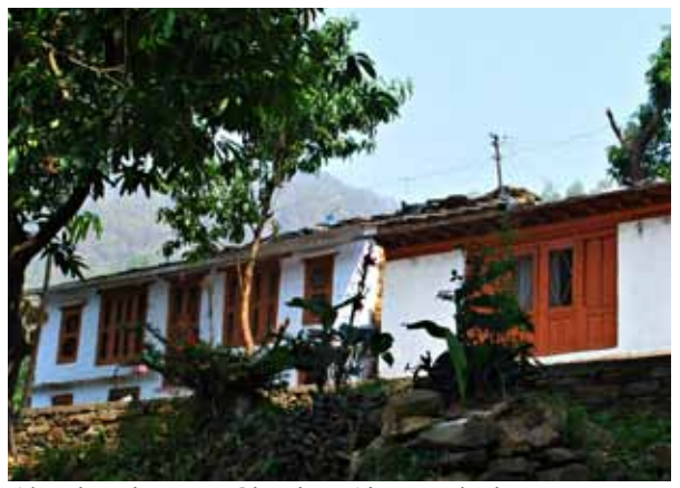
Abandoned House, Gharsiary, Almora District